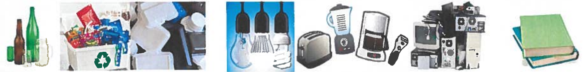
Glass Jars, Flexible Plastic Packaging and Polystyrene Packaging

Recycle these items for free at the Summerland Landfill Recycling Depot during regular business hours (without having to cross the landfill scale)