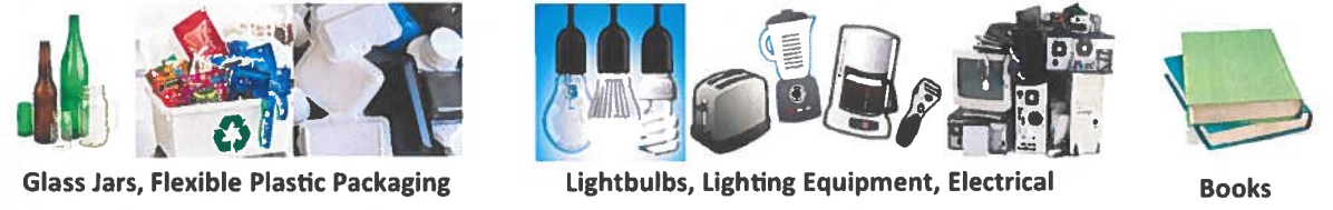
Glass Jars, Flexible Plastic Packaging Lightbulbs, Lighting Equipment, Electrical Books

17202 Bathville Road Open 8:30am - 4:15pm Monday to Saturday Closed Sundays, Stat Holidays and Boxing Day