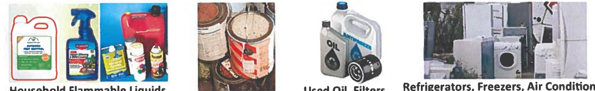
Household Flammable Liquids, Residential Pesticides

Additional free recycling accessed by going over the landfill scale