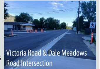
Victoria Road & Dale Meadows Road Intersection

Construction on Victoria Road and Dale Meadows Road has wrapped up. Crews upgraded existing water mains and services and installed new water infrastructure for water system separation. Continuation of the multi-use path extended north on Victoria Road and a new multi-use path was built on Dale Meadows Road to provide better access to the Dale Meadows Sports Complex. Victoria Road was rebuilt with two lifts of asphalt to accommodate the large volume of passenger and truck traffic. Incorporating a new pedestrian crossing at the Dale Meadows Road and Victoria Road intersection will provide a safer crossing point for pedestrians and cyclists crossing Victoria Road. The District appreciates the patience from residents as well as the community that travelled this area of Summerland during construction.