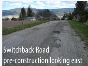
Switchback Road pre-construction looking east

Residents of Summerland will see additional paving in three areas of the District over the next two months. Parts of Harris Road and Switchback Road will be resurfaced with asphalt, and Prairie Valley Road will have road surfacing and base work completed between Morrow Avenue and Doherty Avenue (Landfill Hill).