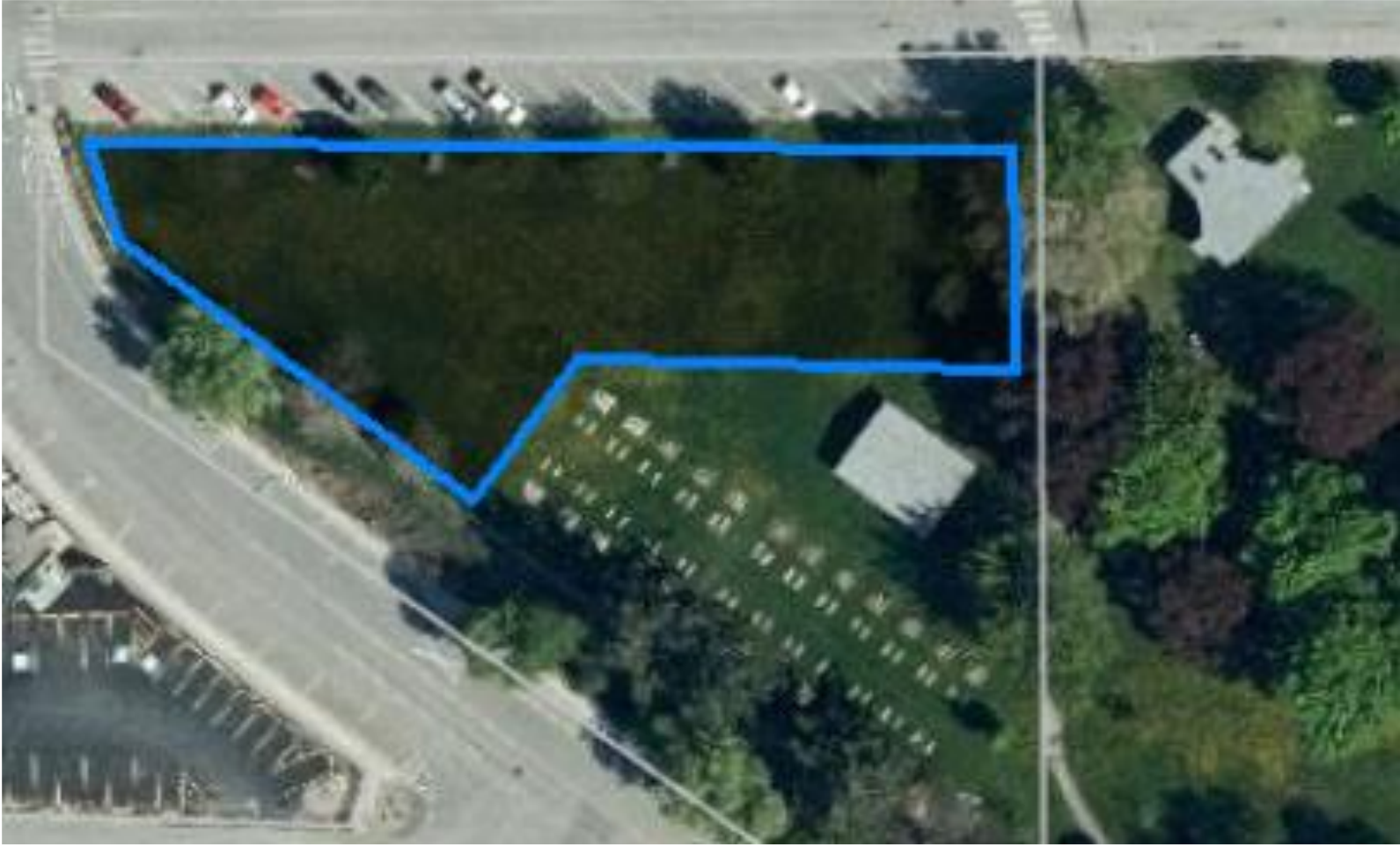
Memorial Park 0.54 Acres