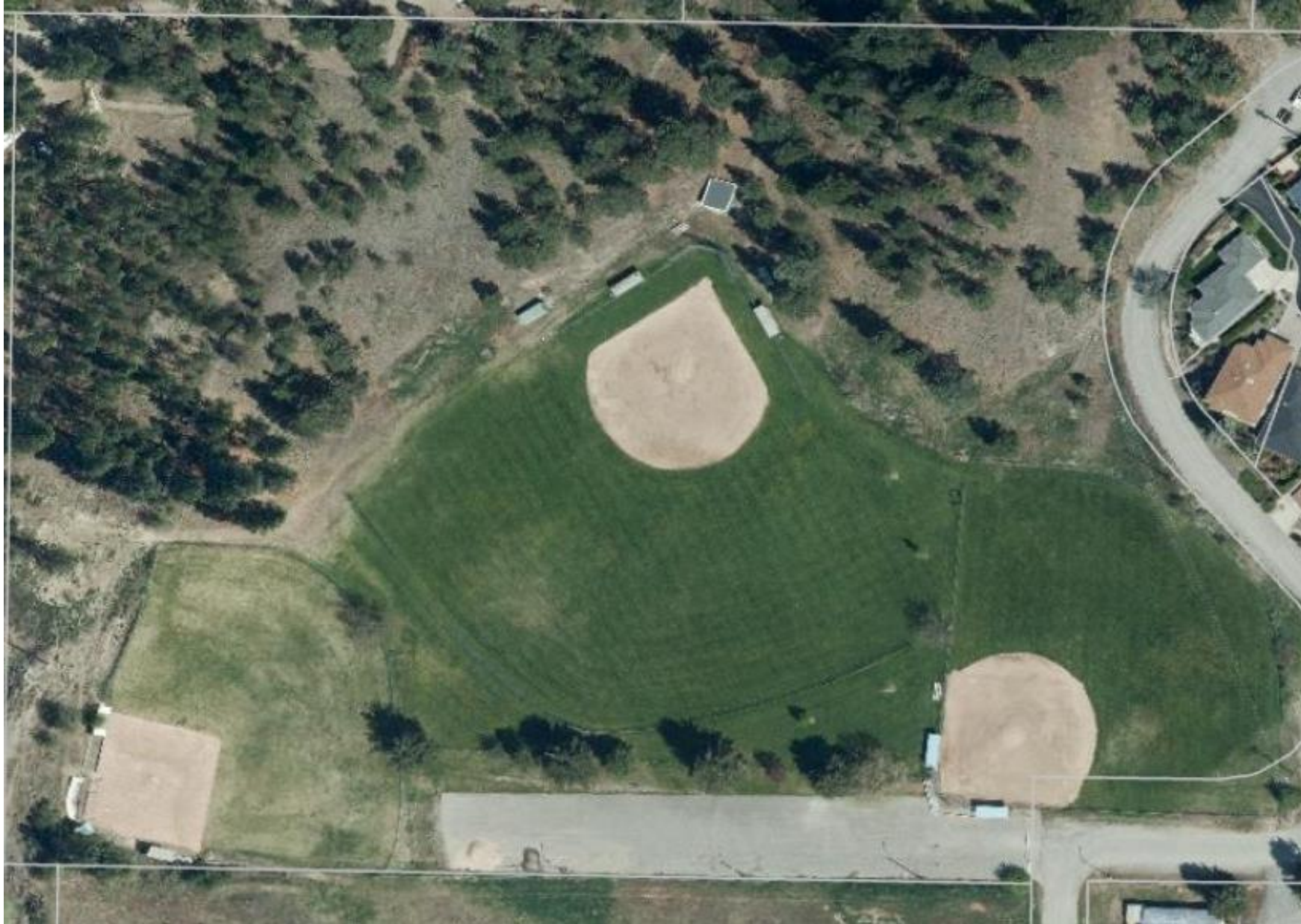
Living Memorial Baseball Park