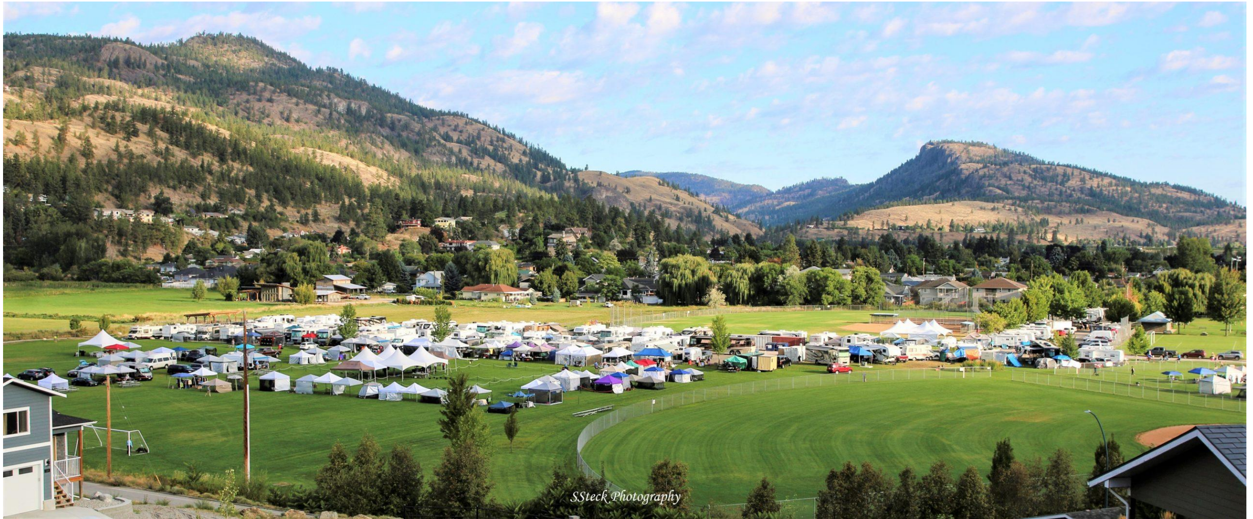
Dale Meadows – Dog Show