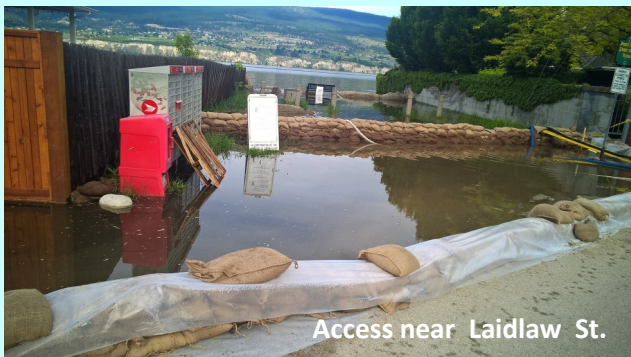
Access near Laidlaw St.

District of Summerland crews and the Summerland Fire Department have been assisted by Ministry of Forests fire crews. Many thanks to the individuals, service groups, organizations, and businesses who have come together as a community to help residents protect their properties from flooding.