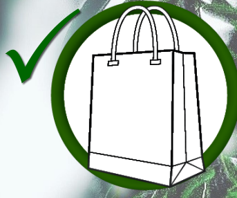
Paper Gift Bags