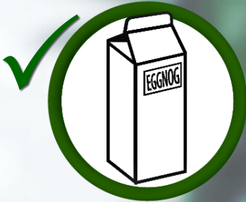
Holiday Drink Cartons