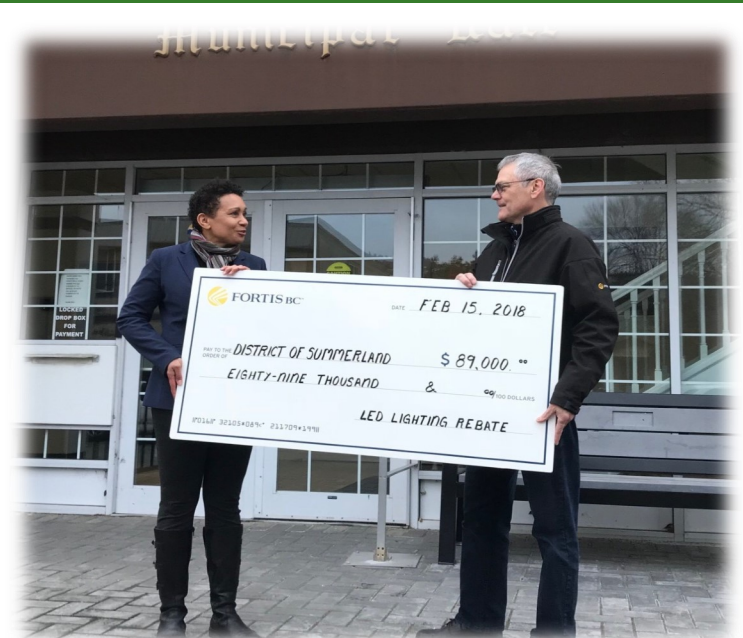
Above: Mayor Boot receives a cheque from FortisBC

After deliberations with Council, the Skatepark Committee and staff, it was decided that for safety reasons, the skatepark is to remain closed until fencing, landscaping, signage and other components have been completed. The public is asked to please stay off the site until it is finished and ready to go. The skatepark will be officially opened in the spring for all to enjoy.