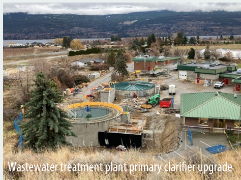
Wastewater treatment plant primary clarifier upgrade

The Wharton Street project is nearly complete with underground utility and roadwork in the downtown core installed. The new all-season washroom is expected to be delivered mid January and opened when weather permits. The District would like to thank businesses and residents for their patience during construction.