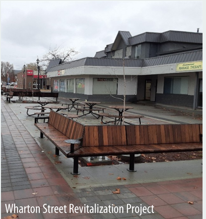
Wharton Street Revitalization Project

The majority of the concrete pours have been completed with the structures now being filled with water to allow for concrete saturation and the completion of leak testing. Some civil works have been exposed in anticipation of piping tie-ins and thermoliner welding completed (installed for the purpose of protecting the concrete walls from hydrogen sulfide gas once in operation).