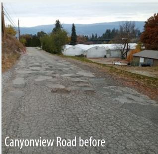
Canyonview Road before

In 2025 the District was able to pave over 22,000m 2 of roads as well as place over 38,000m 2 of recycled asphalt millings over many of our lesser travelled streets, on parking lots and in our landfill. For an interactive look at our road and water upgrade projects, please view our Road and Water Integrated 20 Year Asset Management Plan www.summerland.ca/city-services/works-and-utilities-department/roads .