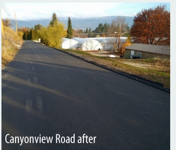
Canyonview Road after

General fund budget discussions were held on December 9 – 10, 2025 with Council proposing a 6.36% property tax increase. Residents are encouraged to attend an open house on January 14, 2026, from 5:00 – 7:00 PM at the Arena Banquet Room located at 8820 Jubilee Rd E. to learn more about the proposed increase.