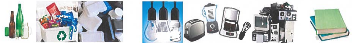
Glass Jars, Flexible Plastic Packaging

17202 Bathville Road Open 8:30am - 4:15pm Monday to Saturday Closed Sundays, Stat Holidays and Boxing Day